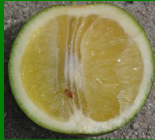
Lopsided, bitter, hard fruit with dark seeds