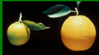
Diseased - Healthy